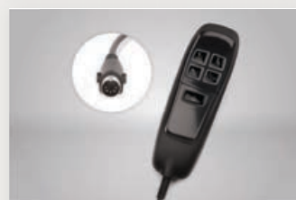
75854 Styleline 5 Button Handset Cable