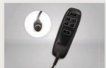
4 73345 Styleline 6 Button Reset Handset Cable