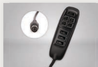
Memory 2 Reset Styleline