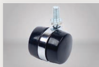
4 x Castor 35mm Twin-Wheel Pin