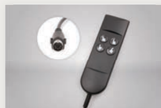
75008 Proline 4 Button