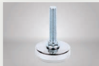
4 x Adjustable Glides Fits seat widths 650