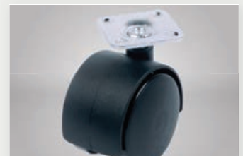
2 x Castor Flange