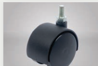
2 x Castor Pin