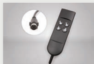
75008 Proline 4 Button