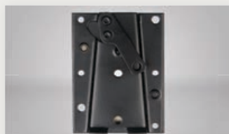
Backrest Bracket - Female LH/RH