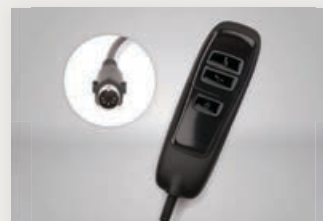
75858 Styleline 3 Button Handset Cable