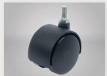
2 x Castor Pin