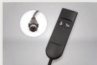
2 Proline 2 Button Handset Cable