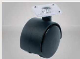
2 x Castor Flange